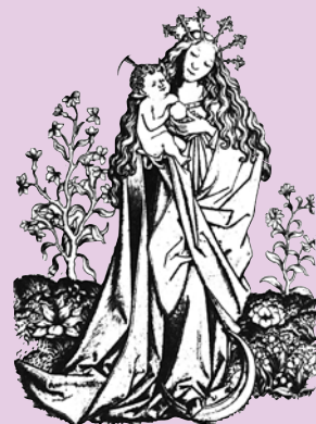
Mary, the first Steward of Christ